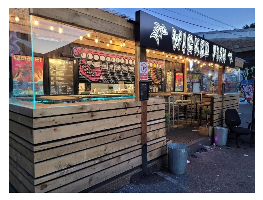
Wicked Fish, 04.21 on 24/06/2023.