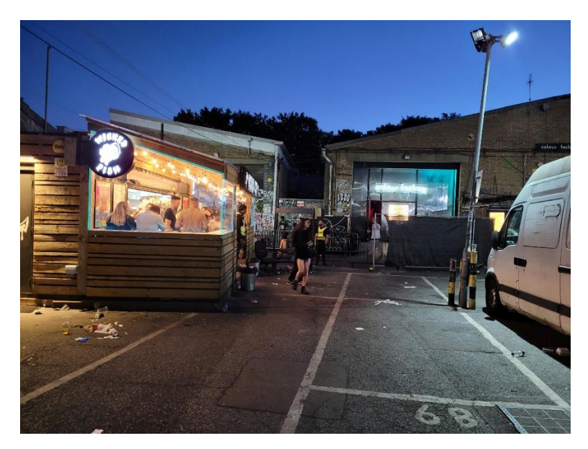
Wicked Fish, 03.49 on 24/06/2023.